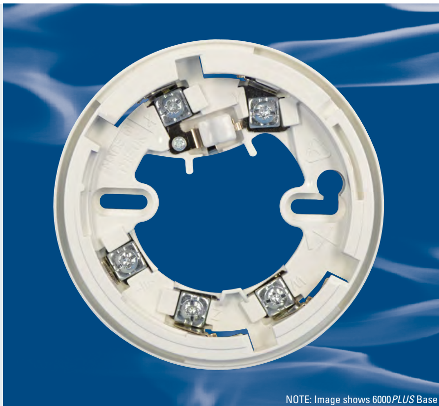
NOTE: Image shows 6000PLUS Base

The Protec 3000PLUS and 6000PLUS standard base are designed for use with either the Protec 3000PLUS or 6000PLUS series fire detection devices. It allows the detectors to be mounted directly to any flat surface, or BESA box. Provision is also made for surface mount trunking entry via side breakouts.